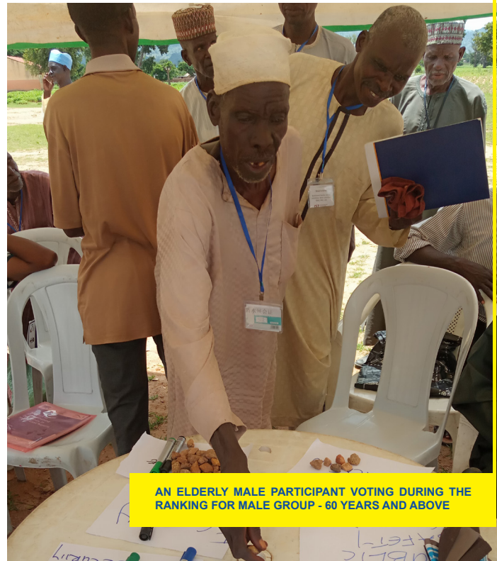
AN ELDERLY MALE PARTICIPANT VOTING DURING THE RANKING FOR MALE GROUP - 60 YEARS AND ABOVE

Our resources in the ward are reflected in the lists below: