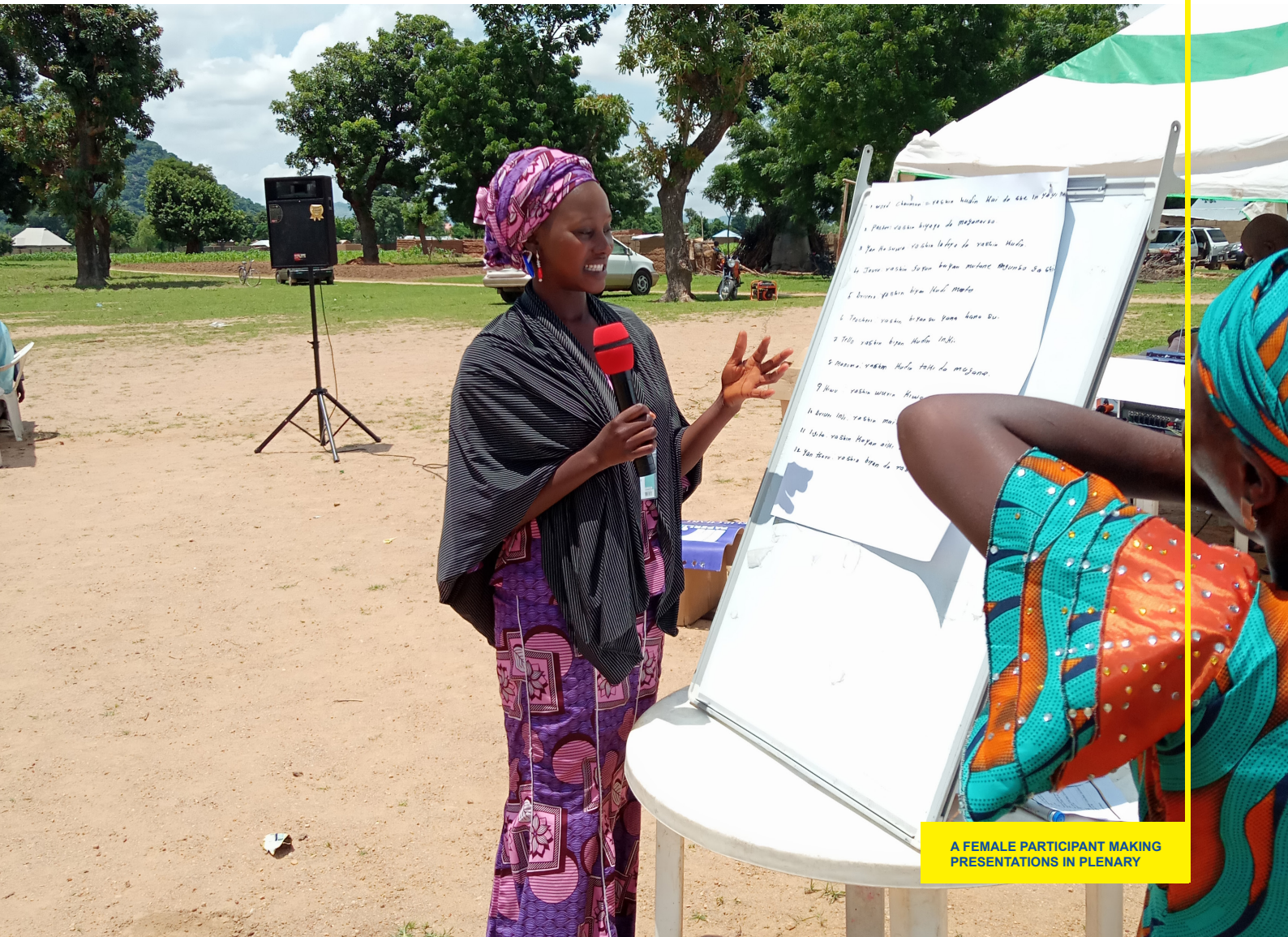
A FEMALE PARTICIPANT MAKING PRESENTATIONS IN PLENARY