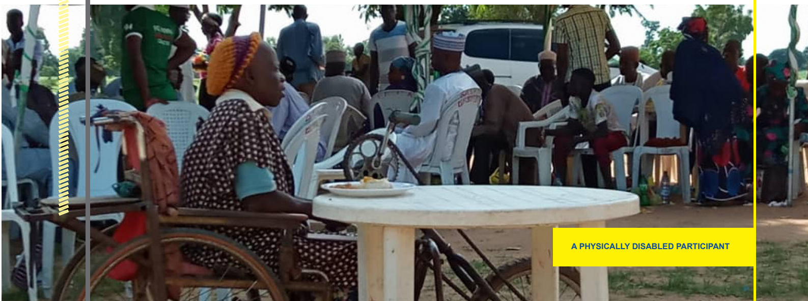
A PHYSICALLY DISABLED PARTICIPANT