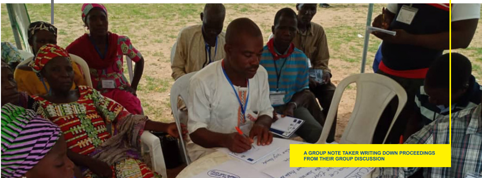
A GROUP NOTE TAKER WRITING DOWN PROCEEDINGS FROM THEIR GROUP DISCUSSION