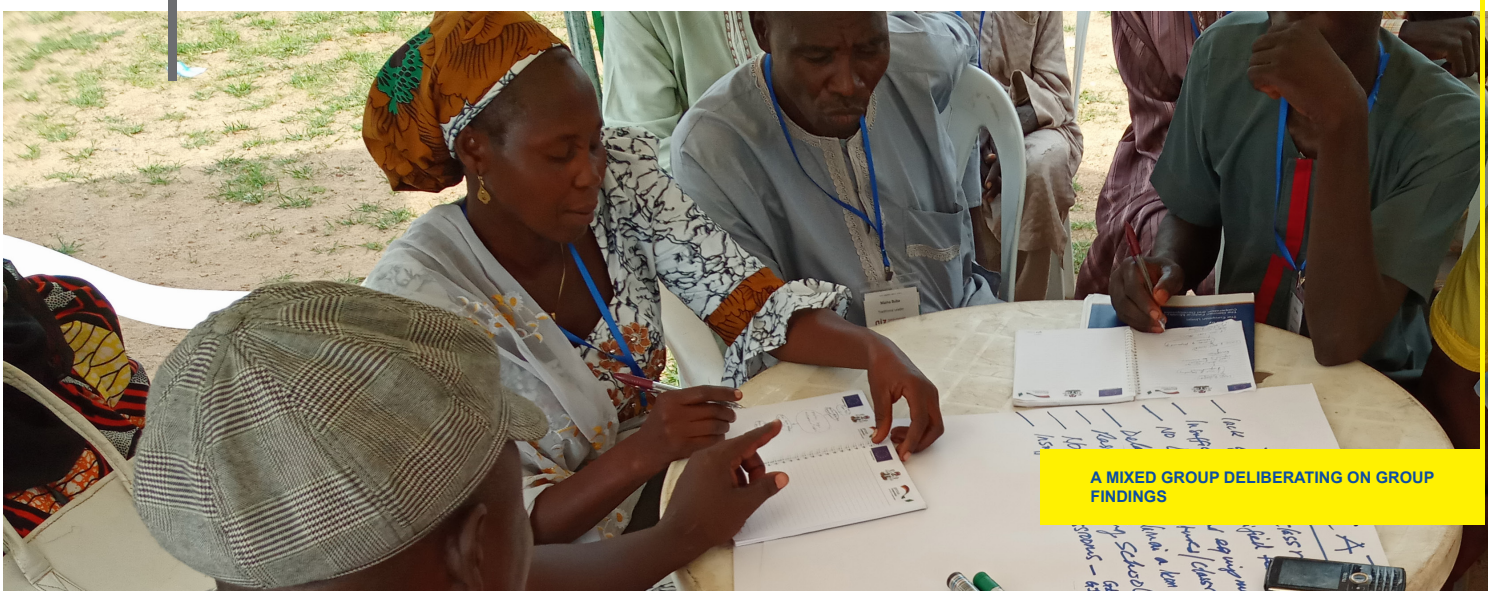
A MIXED GROUP DELIBERATING ON GROUP FINDINGS