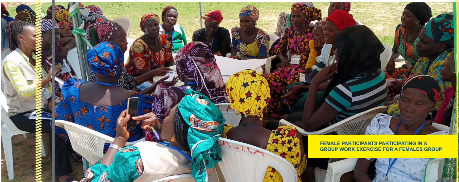
FEMALE PARTICIPANTS PARTICIPATING IN A GROUP WORK EXERCISE FOR A FEMALES GROUP