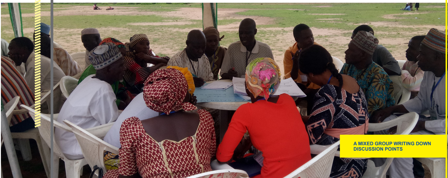
A MIXED GROUP WRITING DOWN DISCUSSION POINTS