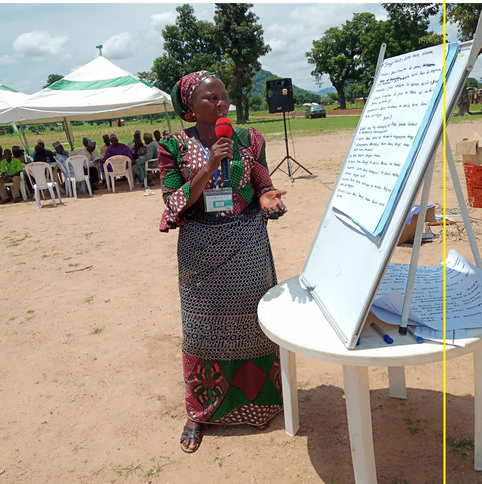
A FEMALE PARTICIPANT MAKING PRESENTATIONS IN PLENARY