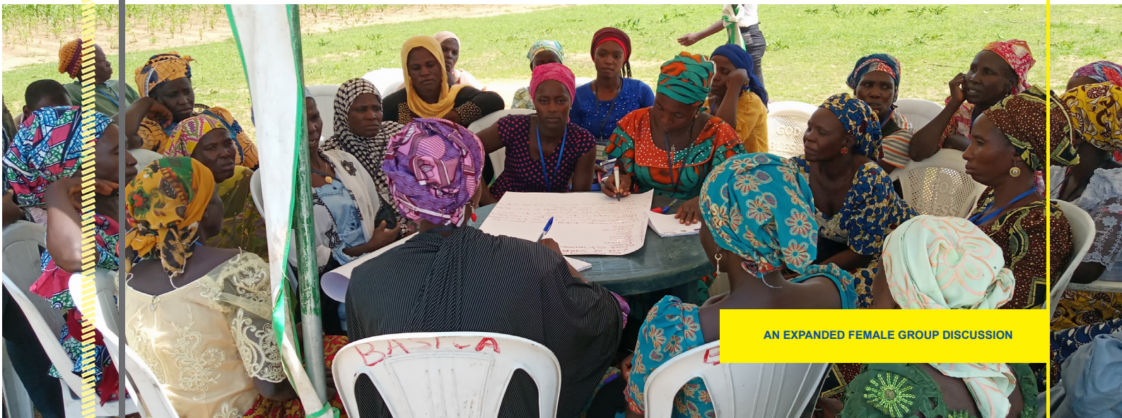
AN EXPANDED FEMALE GROUP DISCUSSION