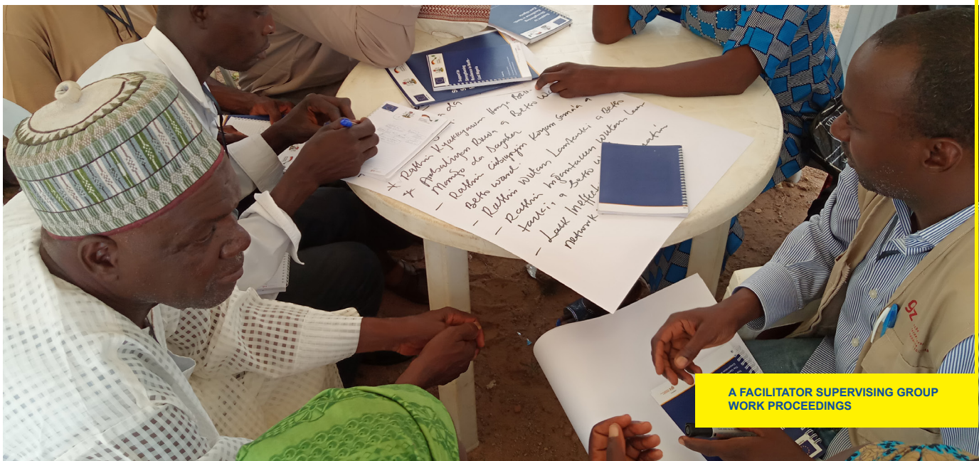
A FACILITATOR SUPERVISING GROUP WORK PROCEEDINGS

Arable land for farming, Madrik for timber, large lake for fishing, maternity health centres, primary and secondary schools are some of the natural and man-made resources found in the ward. Lack of access road to our ward especially at the peak of the rainy season is our major problem as well as a lack of specialist/cottage hospital. Science teachers and laboratories and a high rate of unemployment among our youths are also some of the problems we face. Our most pressing problems include lack of basic physical infrastructure, water & sanitation and proper healthcare in our community. A Ward Projects Supervisory Committee was constituted to follow up on our discussions and agreed next steps. Also, lack of financial capacity, poverty and the absence of technical know-how to execute any meaningful development projects are some of the challenges that we face in our pursuit of development.